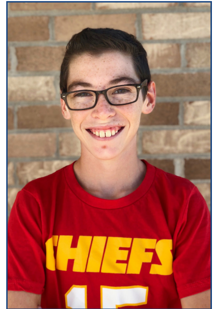
Givers help Shiloh bless children with a new childhood.